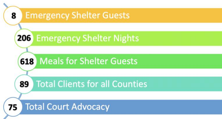
Client service statistics for May 2020

The path to healing begins with honesty. Often, honesty is hard. As Americans, we have to be honest about our country's legacy of racism, discrimination, and violence. As individuals, we have to think critically about our own personal value systems and about our biases and beliefs. And as a nation, we have to protect those who cannot protect themselves. No matter our religious beliefs or thoughts on how we human